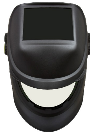
Large Inner Visor