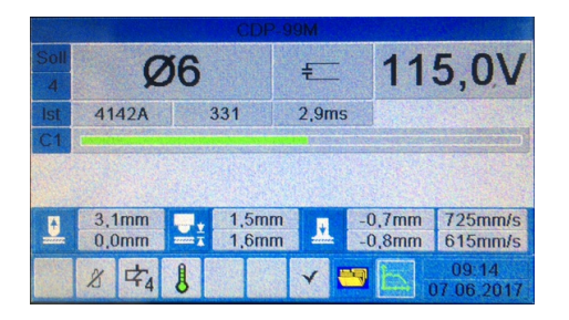
photo 2, above: Activated and ready to use process monitoring system